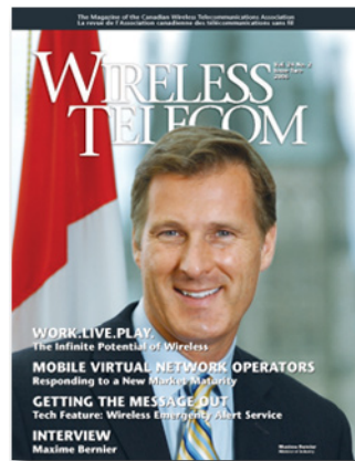
Wireless Telecom , Fall 2006

Wireless Telecom's editorial covers all domestic wireless issues. CWTA is the authority on wireless developments and trends in Canada. Canadians involved in the wireless industry need to read Wireless Telecom in order to keep abreast of regulatory issues and developments. No other wireless or wireless-related publication has a comparable Canadian circulation!